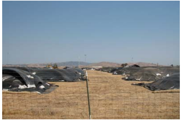
Sand bags are placed on top of plastic sheeting that is covering piles of contaminated soil.