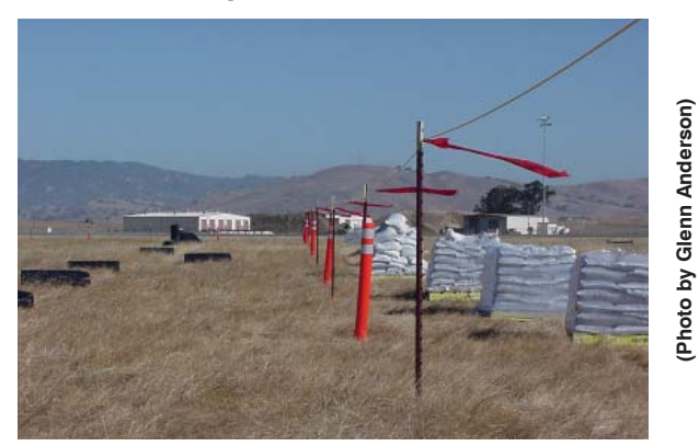
Pallets of sand bags and plastic sheeting are staged along a work zone prior to soil excavation.