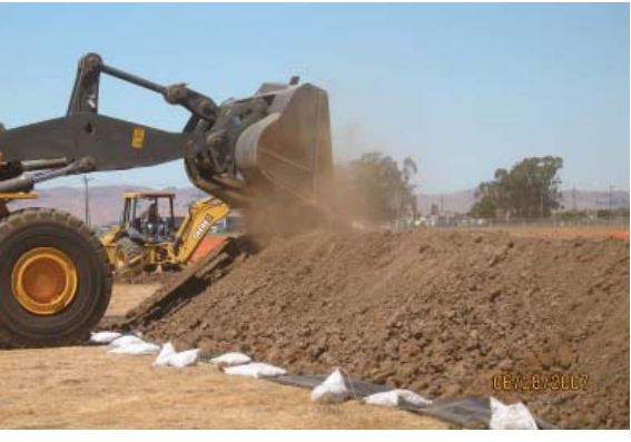
The heavy eqipment operator carefully places contaminated soil on top of a soil pile to minimize the creation of airbourne dust.