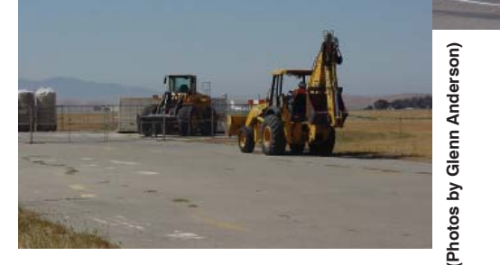
Warning signs along the fenced area allows only authorized personnel to enter the work zones.