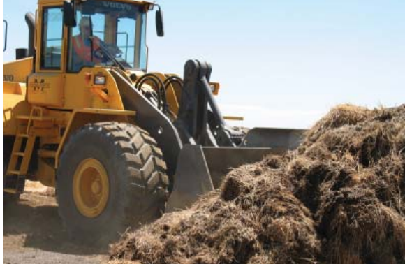
A front end loader gathers the vegetation cover from the Corrective Action Management Unit in the northeast corner of the base.

A family of four burrowing owls watch the activities near its nest. Biologists establish a zone around the nest to ensure that cleanup activities do not adversely impact nearby sensitive habitats.