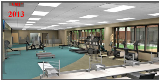
Future Physical Therapy Room