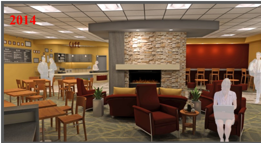
Future Café Room

We are currently working to improve your environment of Care.