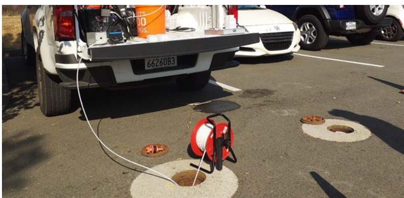
Typical Setup for Groundwater Sampling at Travis AFB