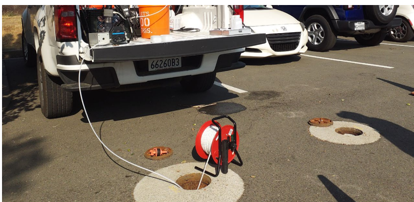
Typical Setup for Groundwater Sampling at Travis AFB