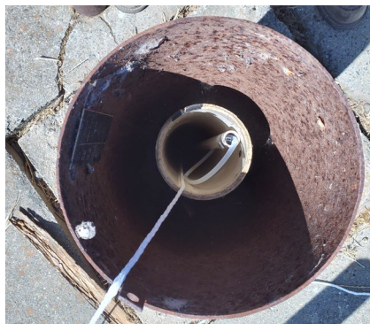
Typical Groundwater Monitoring Well at Travis AFB

Progress continues on the Phase I Remedial Investigation (RI) for Aqueous Film Forming Foam (AFFF) areas at Travis AFB. A sixty month contract was awarded to Sustainment and Restoration Services, LLC (Oneida Team) on July 27, 2021, wherein Oneida-SRS shall execute environmental remedial services necessary to investigate PFAS contamination at Travis AFB. As noted in the October 2021 Guardian , Oneida Team collected groundwater samples at approximately 100 existing monitoring wells in August/September 2021. The groundwater samples are in the final stages of laboratory reporting and data validation for quality review, and data will be available in February 2022 for project team evaluation. Chemists, geologists, engineers, and other scientists will evaluate the initial round of data and current site conditions to make recommendations for the second field event. The second field event, anticipated in May/June 2022, will include installation of additional monitoring wells as well as additional sampling of soil, groundwater, surface water, and sediment. The project team, with participation from our regulatory stakeholders (DTSC, EPA, and San Francisco Bay RWQCB), is looking forward to diving into the data and continuing to make great progress on the RI. Project updates for the Phase I RI will continue to be presented in the Guardian as well as in RAB meetings.