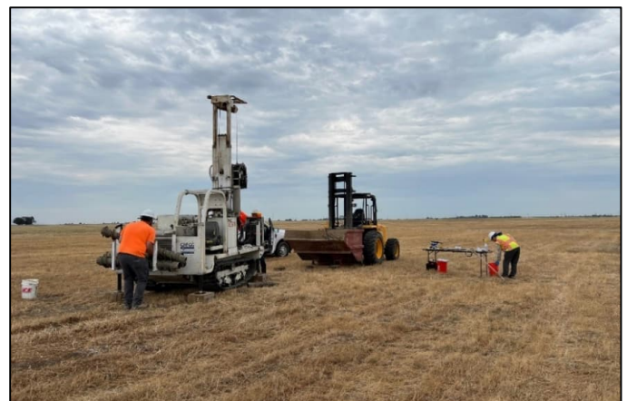
The Oneida project geologist logs soil presented in acetate liners from borings as drillers begin constructing a monitoring well using hollow-stem augers.

As of August 2022, 17 new monitoring wells have been installed, and soil samples have been collected from 38 soil boring locations. Fieldwork will continue into Fall 2022 to install additional monitoring wells and soil borings and to collect soil and groundwater samples for laboratory analysis. Following laboratory analysis, the data will be reported, validated by project chemists, and brought into the project database for evaluation. Data collected in Field Event #2 will be assessed with other site data to make recommendations for Field Event #3, which is anticipated for Summer 2023.