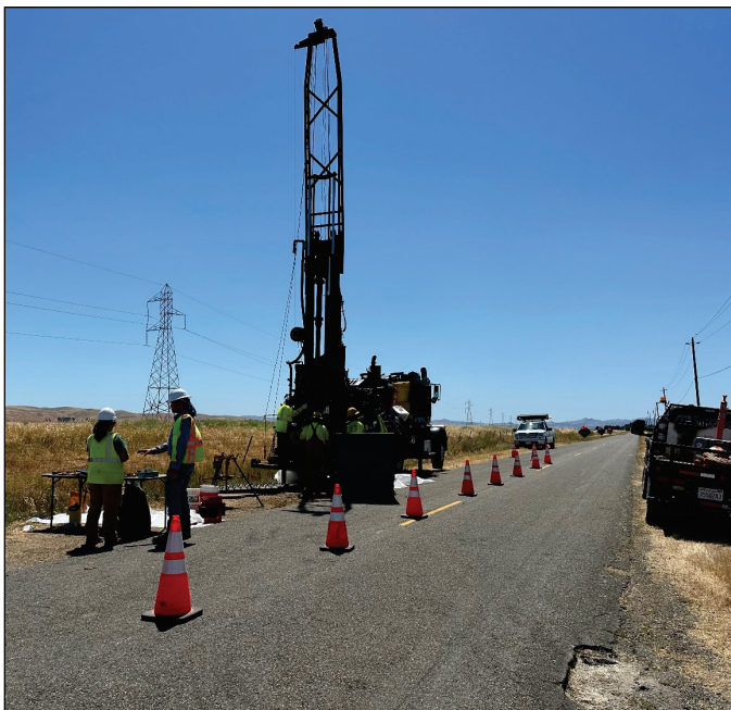
Figure 2: Field team reviewing soil cores as drillers begin constructing a monitoring well using hollow-stem augers.

In June and July 2023, 25 new monitoring wells were installed and sampled. Soil samples were collected, as were groundwater samples from existing wells. Soil and groundwater samples are submitted to an analytical laboratory for chemical analysis to determine if per- and polyfluoroalkyl substances (PFAS) are present associated with the AFFF areas. The field event is scheduled to continue through September 2023.