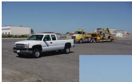
Heavy equipment and supplies arrive on base and are moved to a central staging area.

In the following series of photographs, various aspects of the first two soil actions are shown. From site set-up to soil stockpiling, they convey a lot more detail and hopefully a greater appreciation of the amount of work involved in carrying out a soil cleanup program. ✂