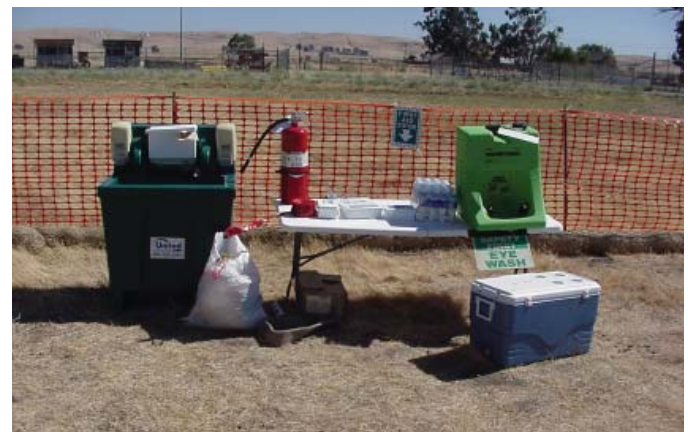
A portable wash facility, a fire extinguisher, an eye wash station and other supplies are staged in the contaminant reduction zone at the former small arms range.