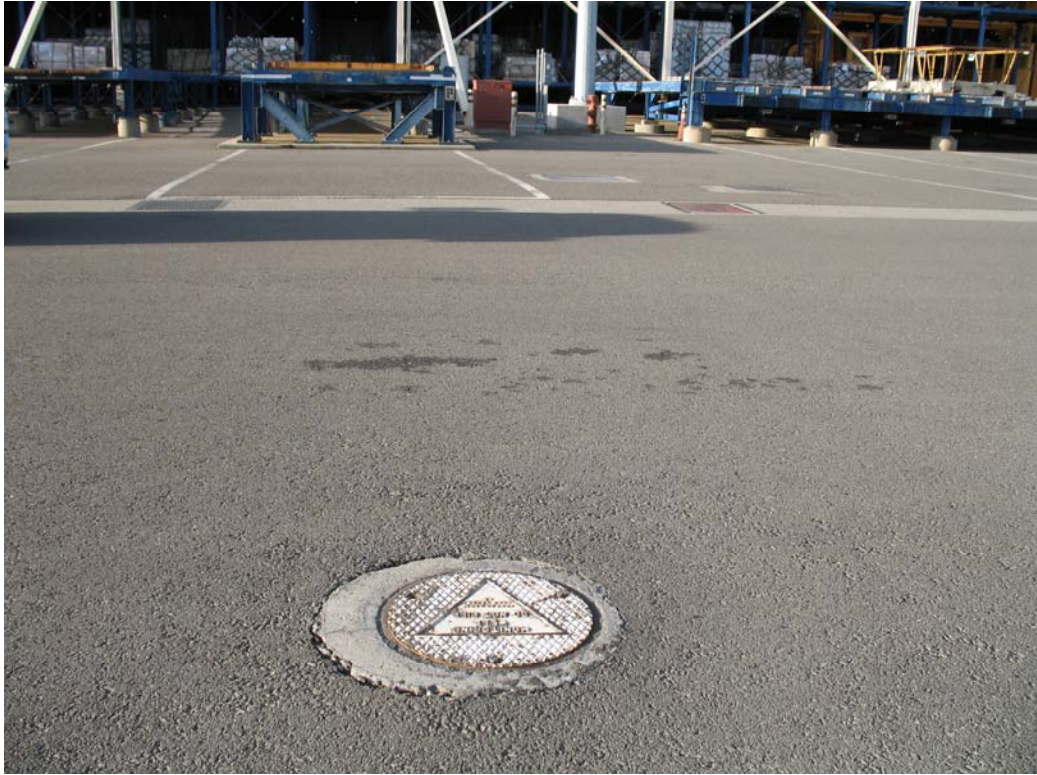
Photograph 5: Controlled Area on Southeast Side of SD037