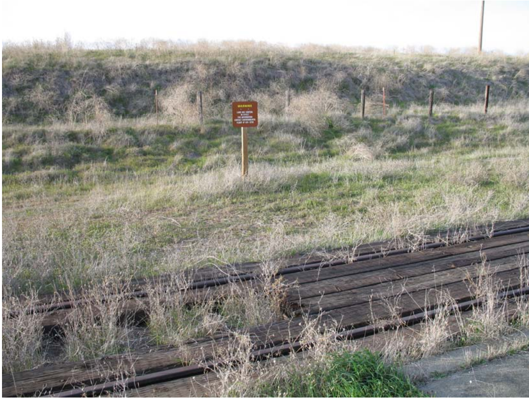
Photograph 15: Warning Sign at West Side of SS046.