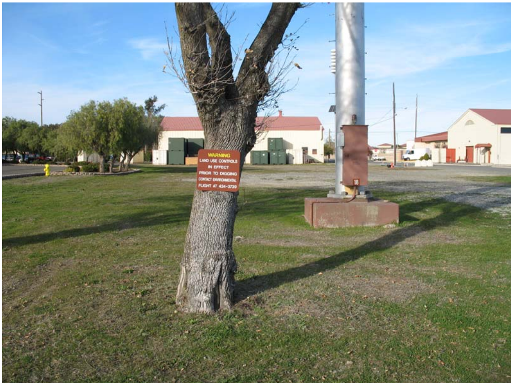
Photograph 2: Controlled Area at SS016.