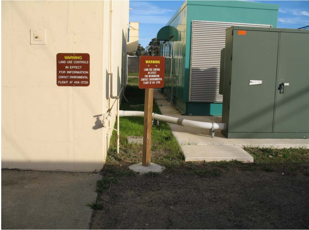
Photograph 9: Generator Pad and Warning Signs at SD043. Stanchion of Former Pad with Leaking Transformers is visible in the foreground.