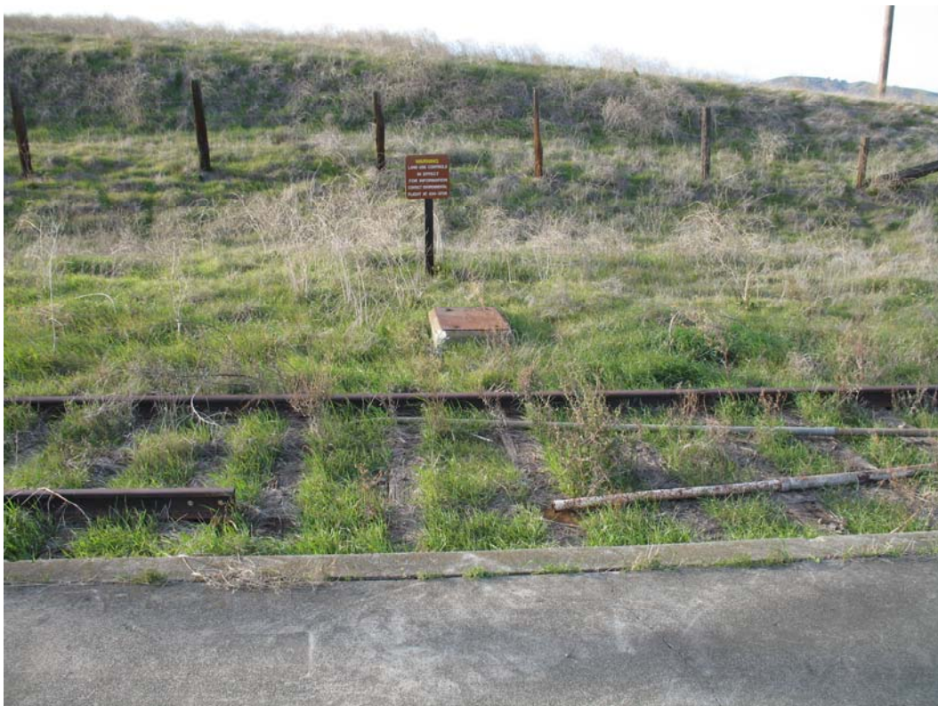
Photograph 14: Warning Sign at East Side of SS046.