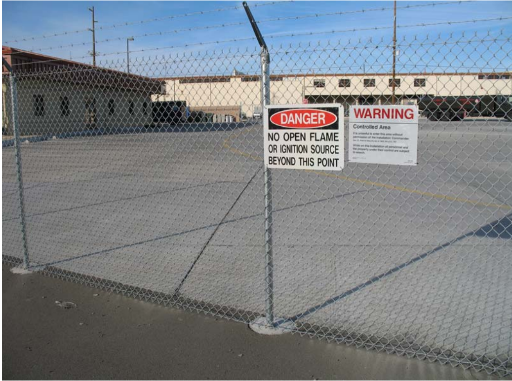
Photograph 1: Controlled Area at SS015.