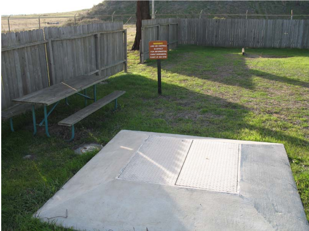
Photograph 7: Controlled Area at DP039