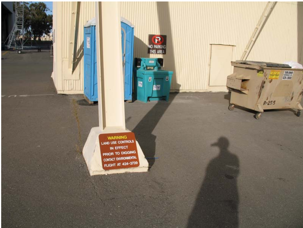
Photograph 4: Warning Sign at Controlled Area on West Side of SD033.