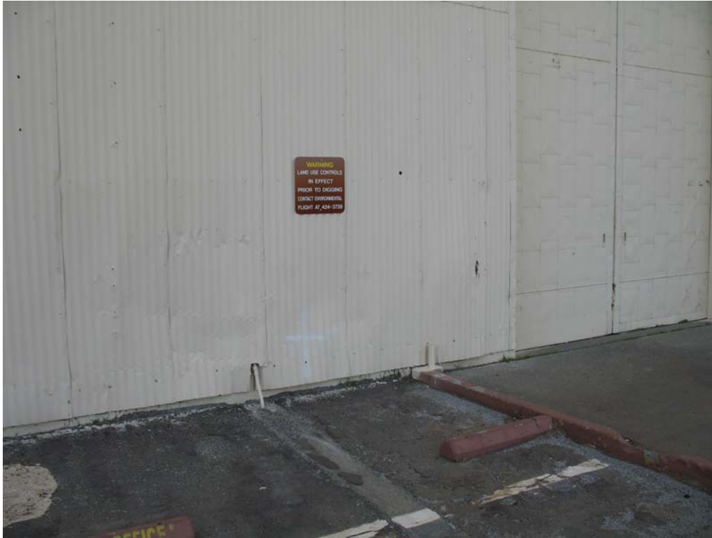
Photograph 3: Warning Sign at Controlled Area on East Side of SD033.