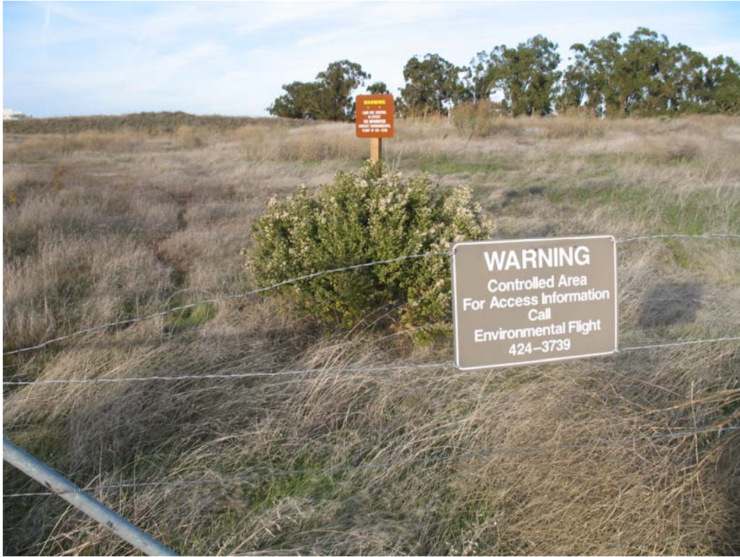
Photograph 11: Warning Signs on Fence and behind the South Access Gate.