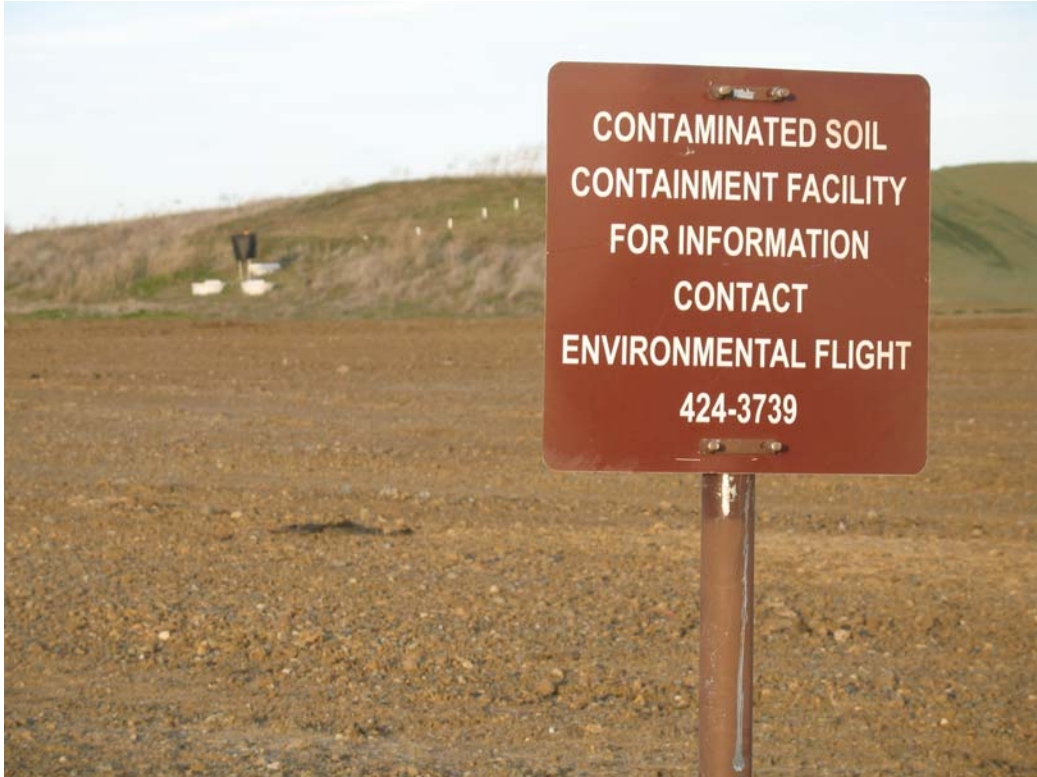
Photograph 17: Warning Sign at Expanded CAMU.