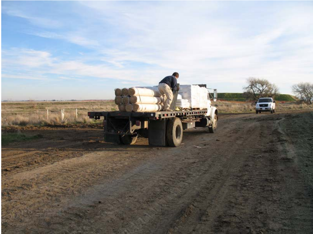
Photograph 19: Completion of CAMU Construction.