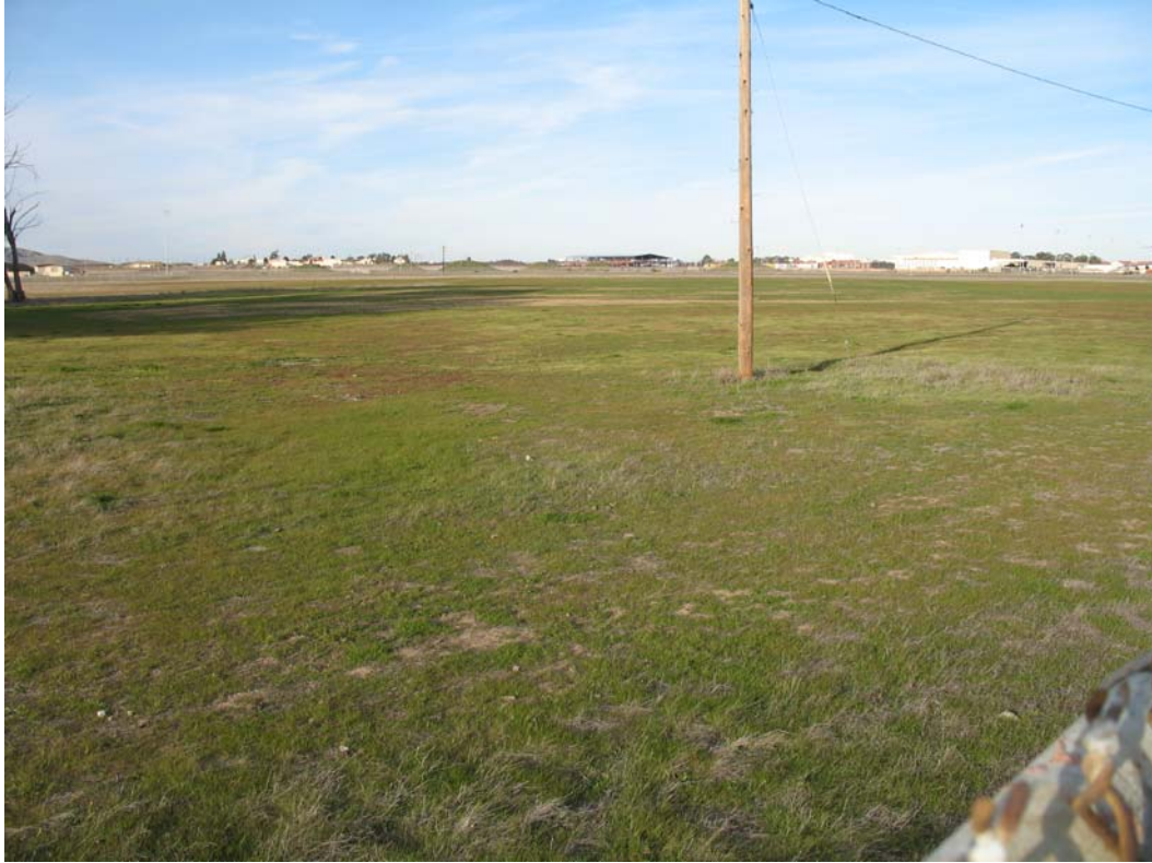
Photograph 13: Site SD045 Post-Remediation.