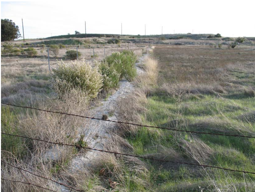
Photograph 12: Fencing and Berm on East Side of LF044.