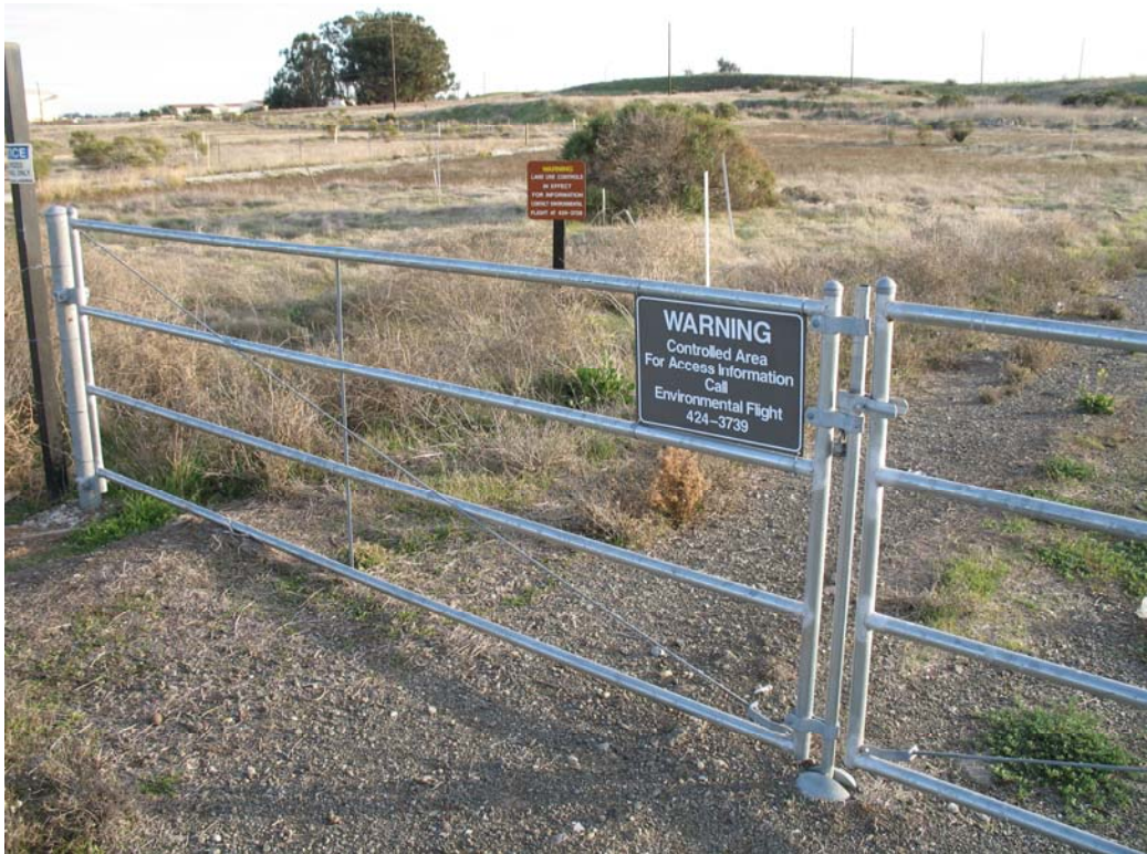
Photograph 10: Warning Signs at Entrance and on fence near the North Access Gate.