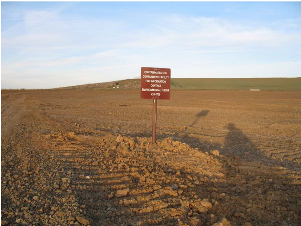
Photograph 18: Warning Sign at Expanded CAMU.