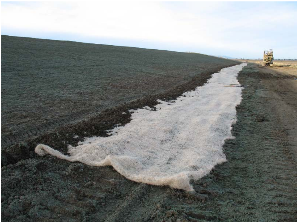
Photograph 20: Erosion Protection Skirt At Base of CAMU.