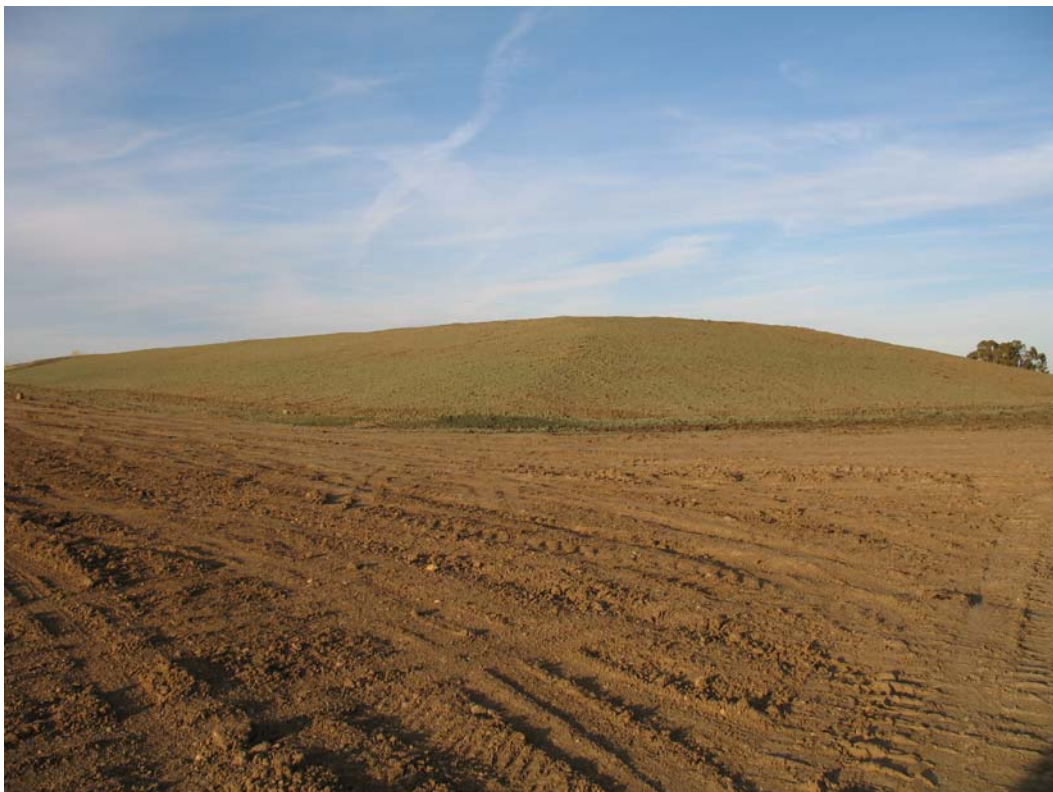
Photograph 16: South Side of Expanded Travis AFB CAMU.