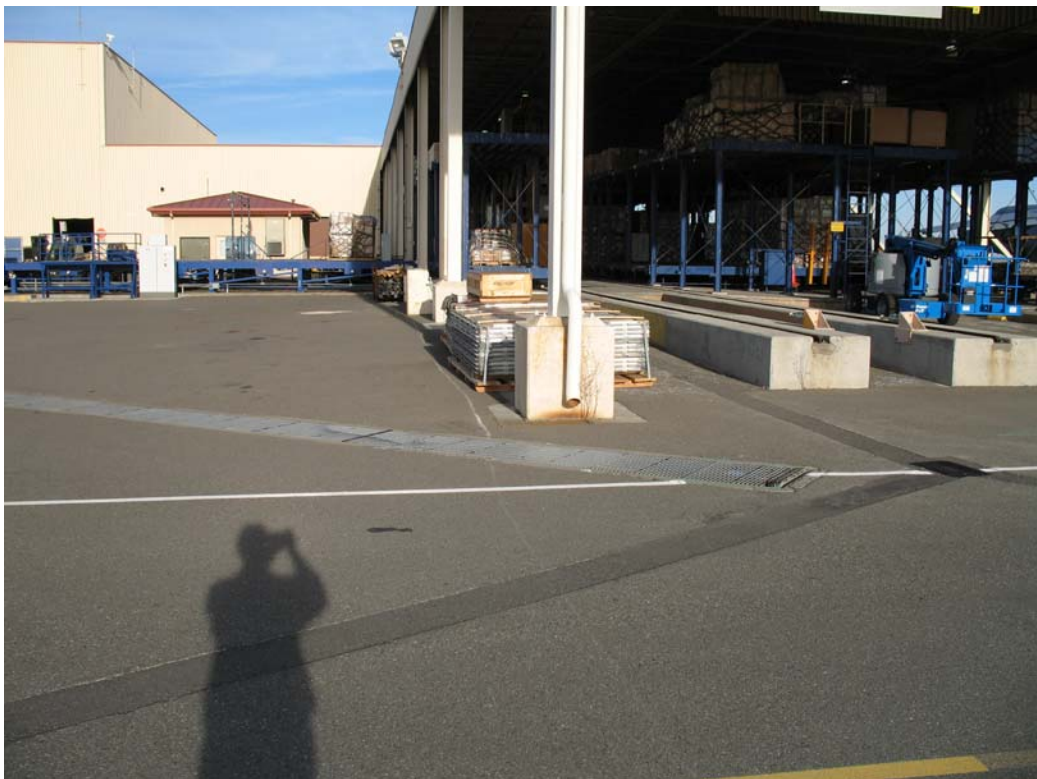
Photograph 6: Controlled Area on Southwest Side of SD037