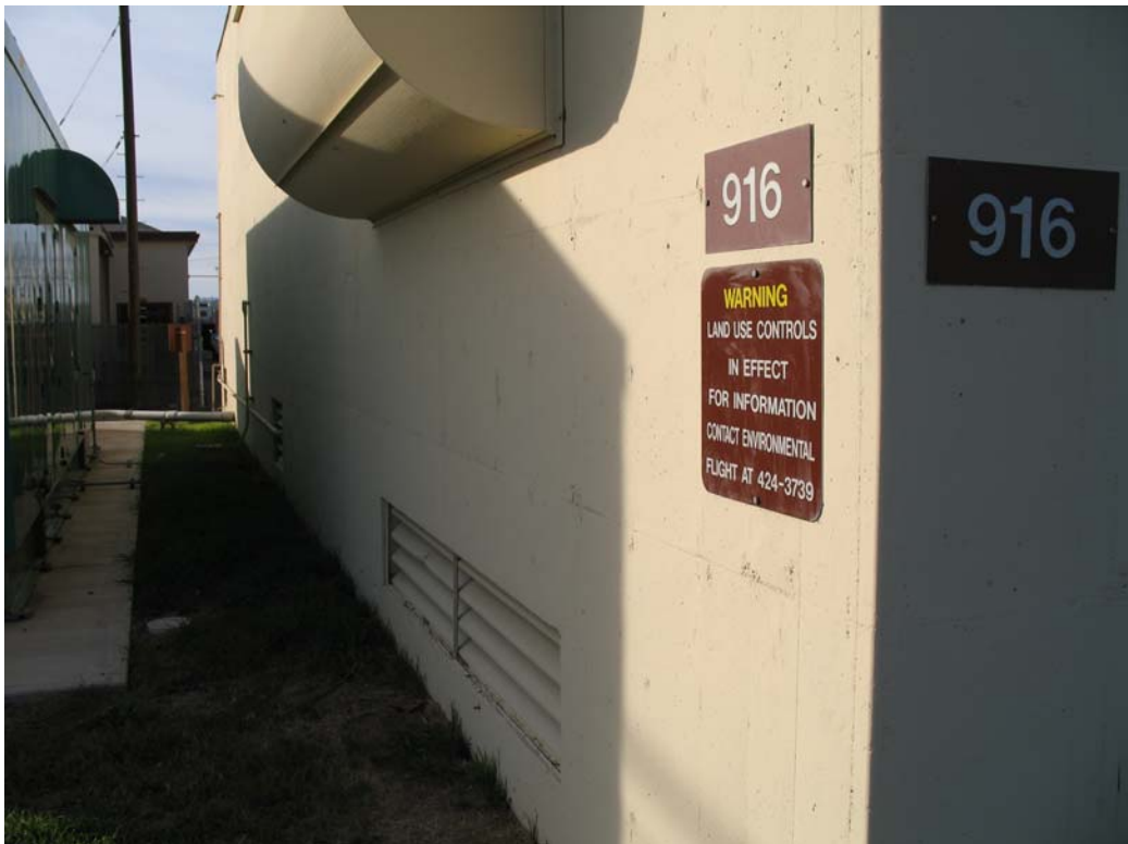
Photograph 8: Southeast Corner of Installed Generator at SD043