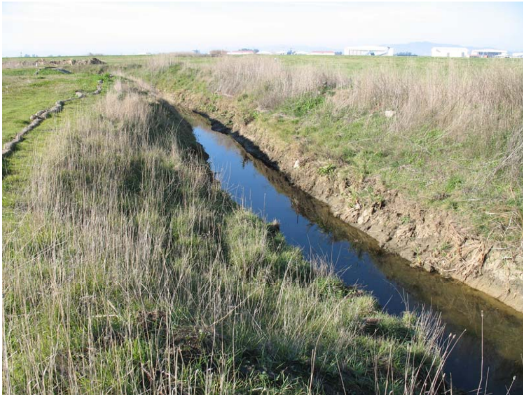
Photograph 22: Controlled Area at SD001 After Cleanup.