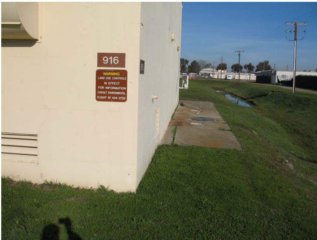
Photograph 8: Sign near East Side of Installed Generator at SD043