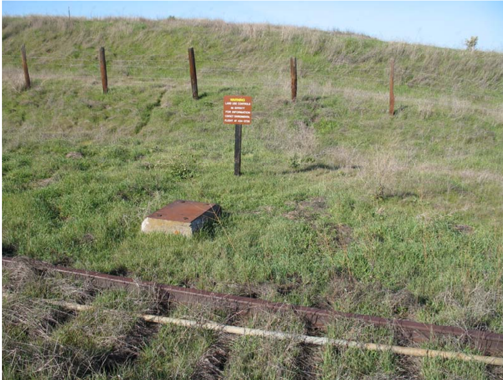
Photograph 15: Warning Sign at West Side of SS046.