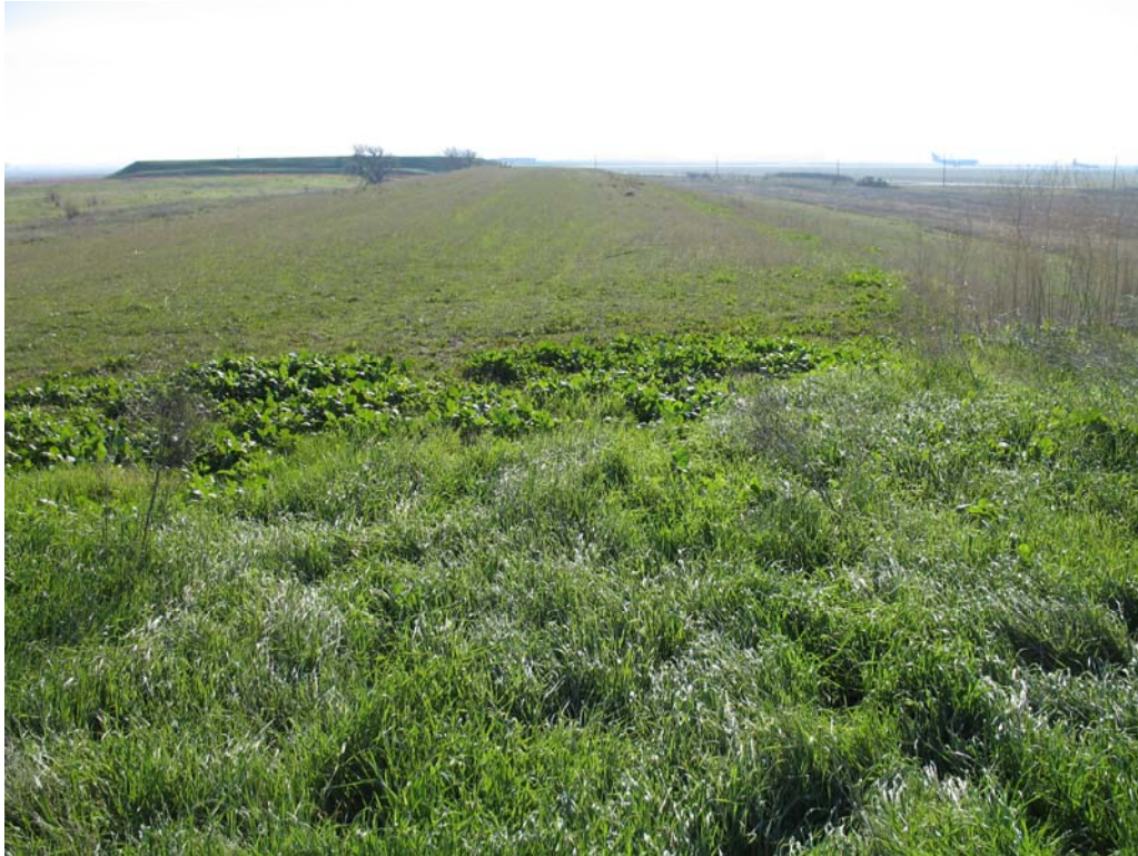
Photograph 17: Top of CAMU Phase 3 (Northwest End).