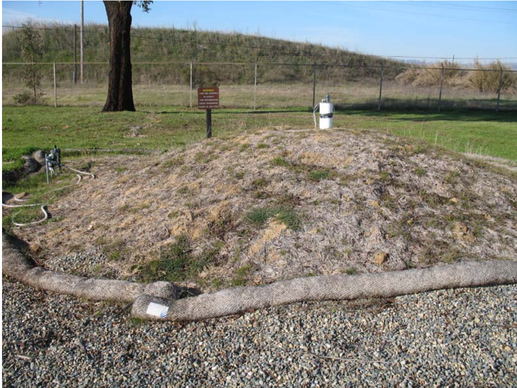
Photograph 7: Controlled Area at DP039 (Post Bioreactor Construction)