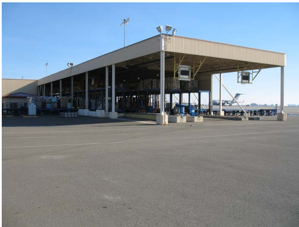
Photograph 6: Controlled Area on Southwest Side of SD037