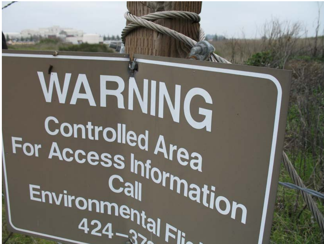
Photograph 13: Warped Warning Sign.