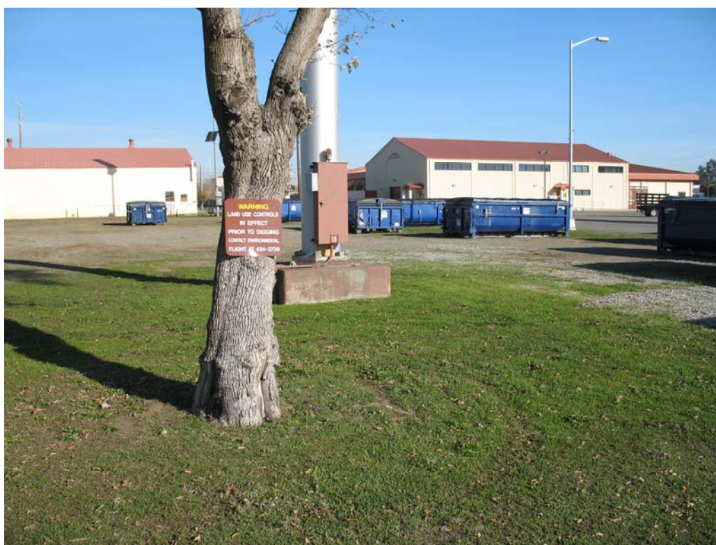
Photograph 2: Controlled Area at SS016.