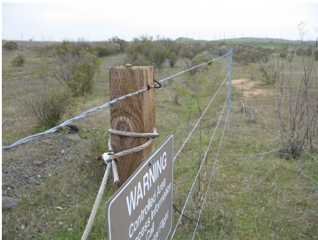
Photograph 11: West Side of LF044 Fence.