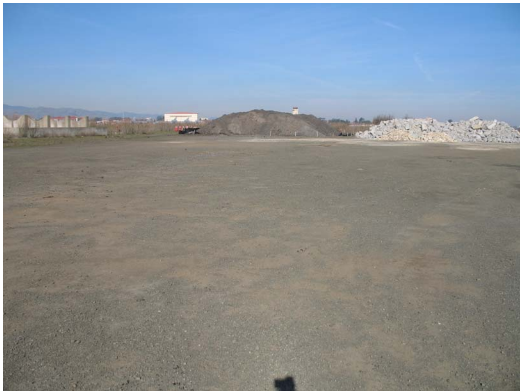
Photograph 20: Controlled Area at FT005.