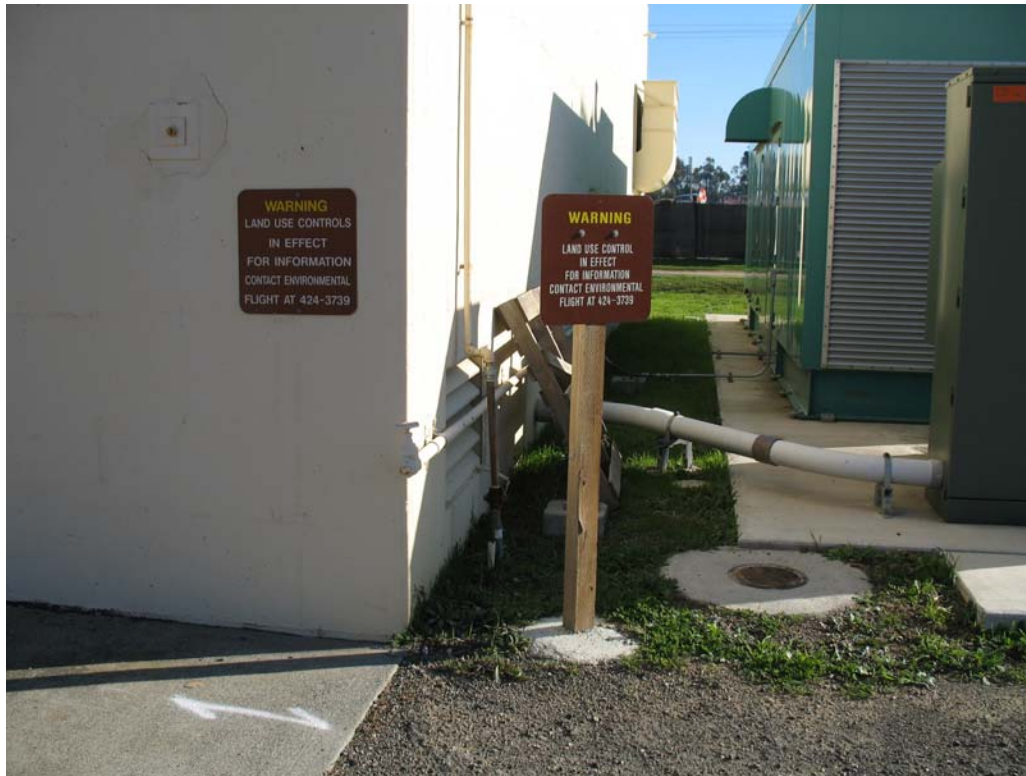
Photograph 9: Generator Pad and Warning Signs at SD043. Stanchion of Former Pad with Leaking Transformers is visible in the foreground.