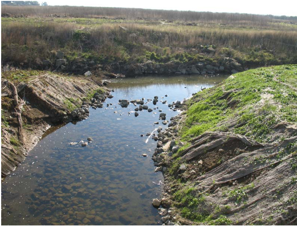
Photograph 21: Controlled Area at Sediment Portion of SD033 After Cleanup.