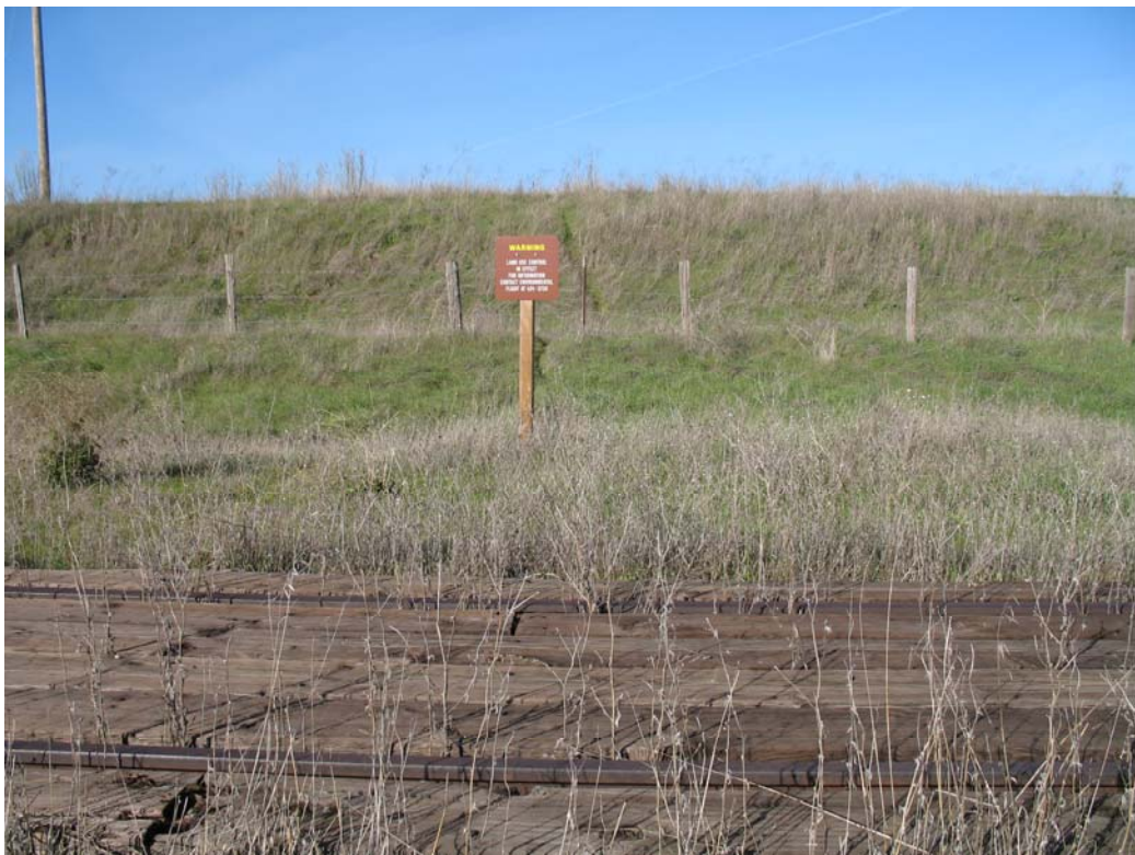
Photograph 16: Warning Sign at East Side of SS046.