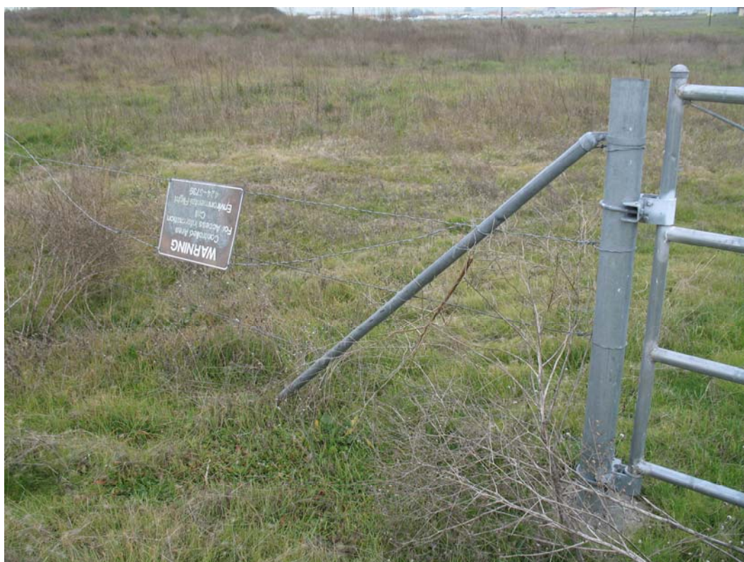
Photograph 12: Broken Fence Strand on South Side of LF044.