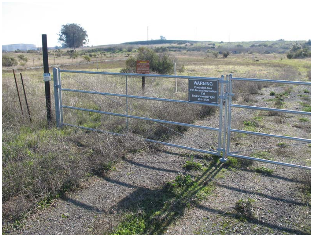
Photograph 10: Warning Signs at LF044 Entrance near the North Access Gate.