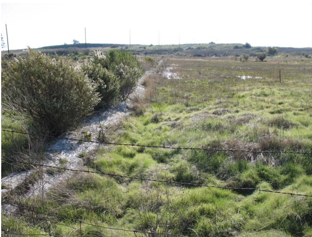
Photograph 14: Fencing and Berm on East Side of LF044.