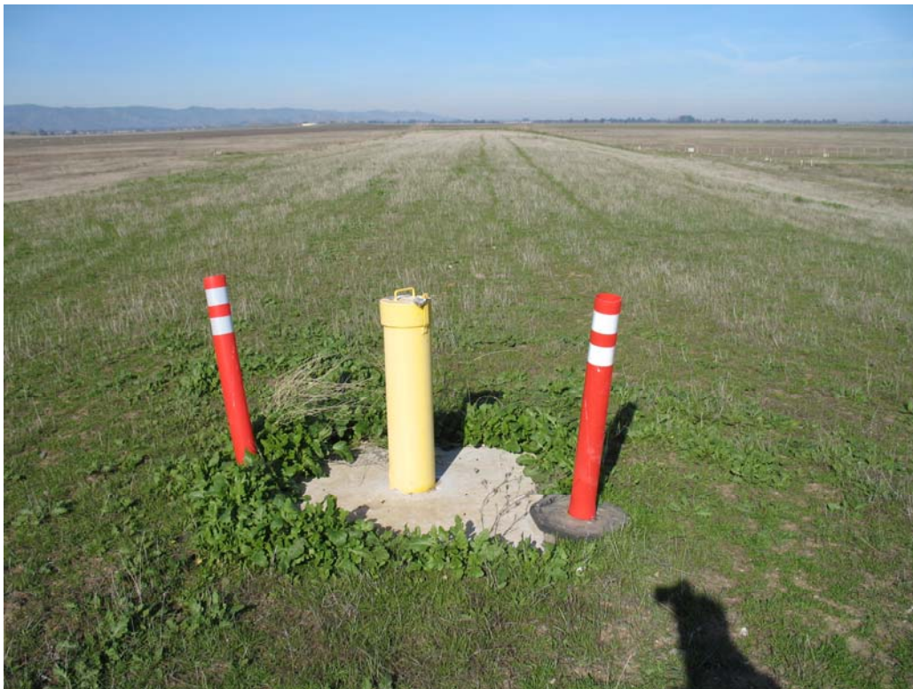
Photograph 18: Top of CAMU Phase 3 (Southeast End).