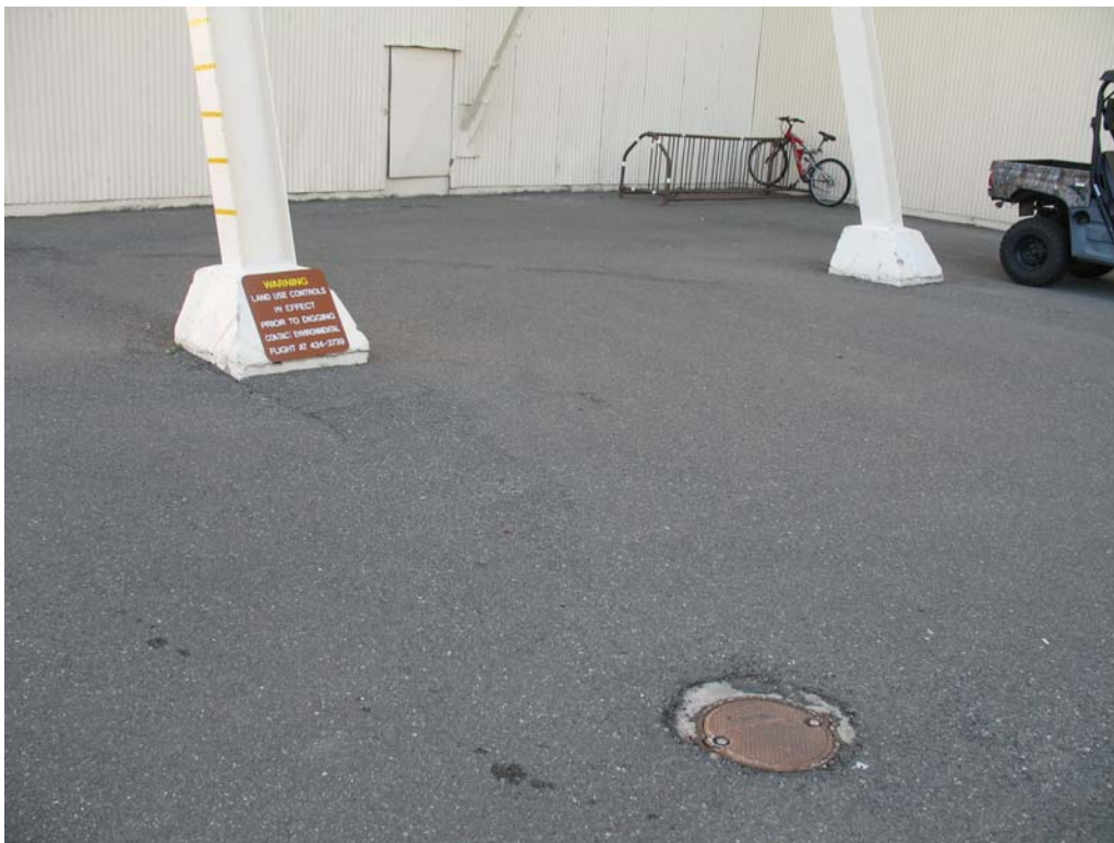
Photograph 4: Warning Sign at Controlled Area on West Side of SD033 (soil).