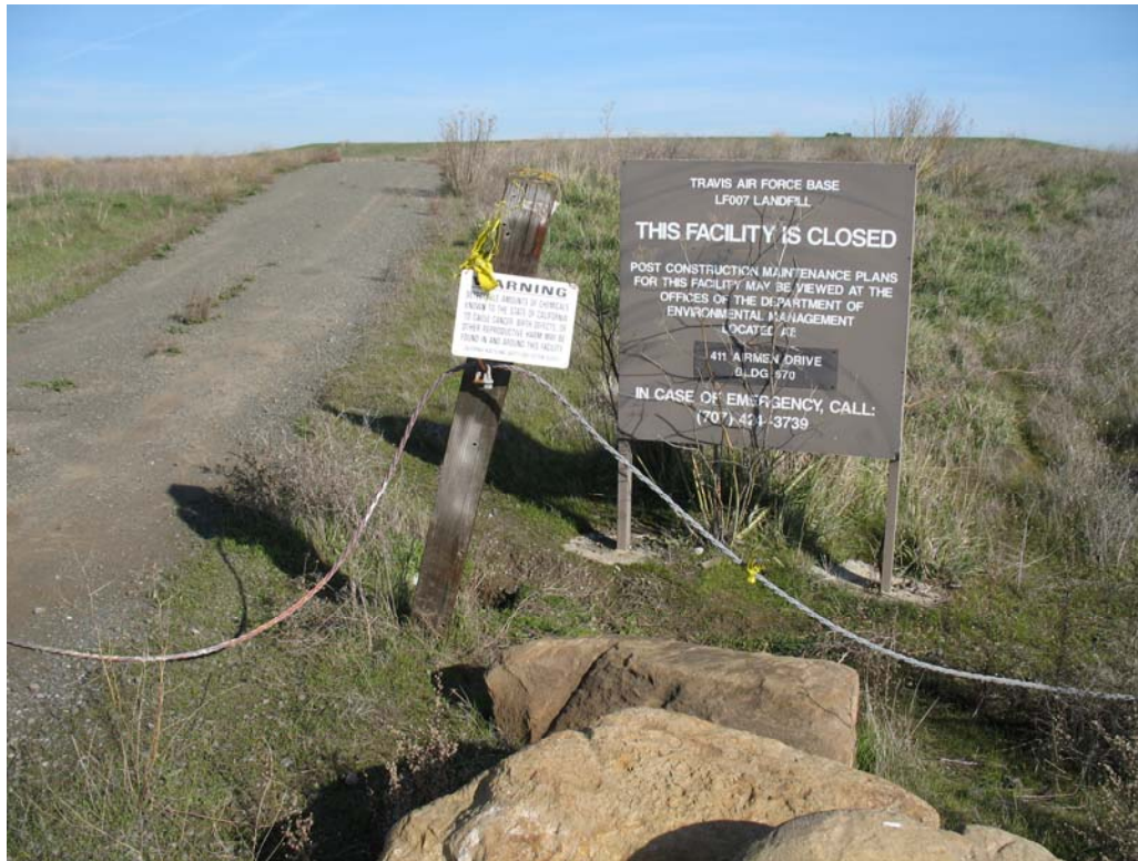
Photograph 19: Warning Sign at CAMU Phase 3 Entrance.