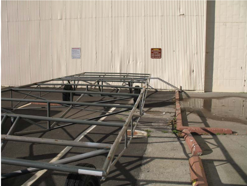
Photograph 3: Warning Sign at Controlled Area on East Side of SD033 (soil).