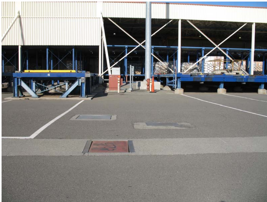
Photograph 5: Controlled Area on Southeast Side of SD037