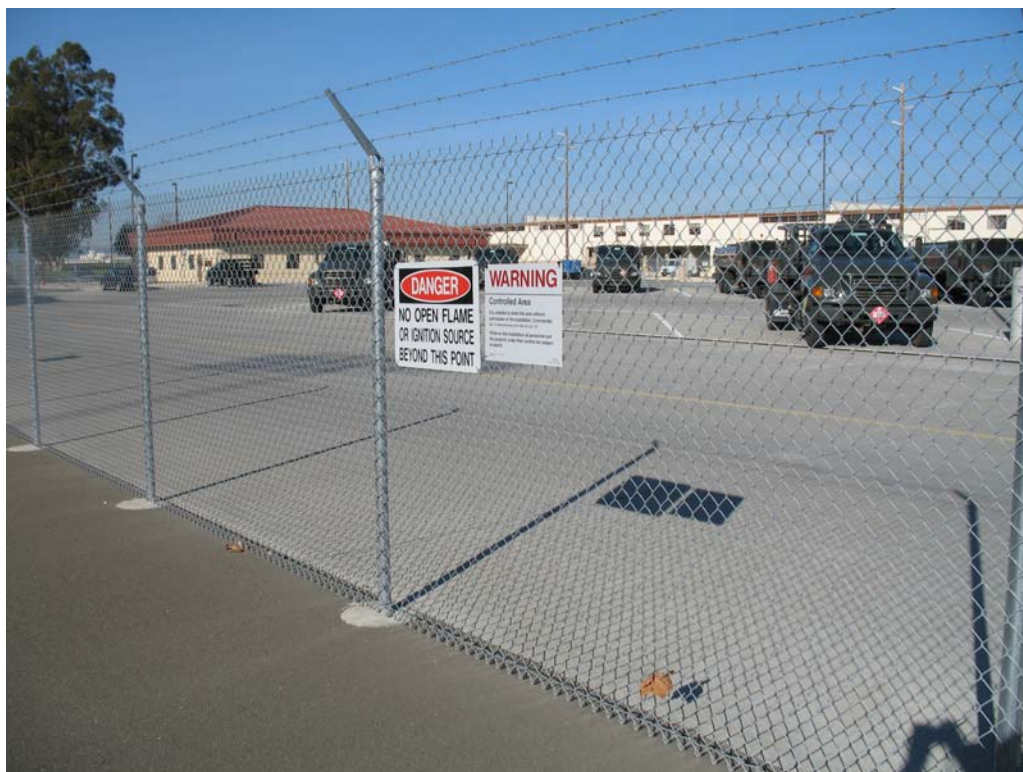
Photograph 1: Controlled Area at SS015.