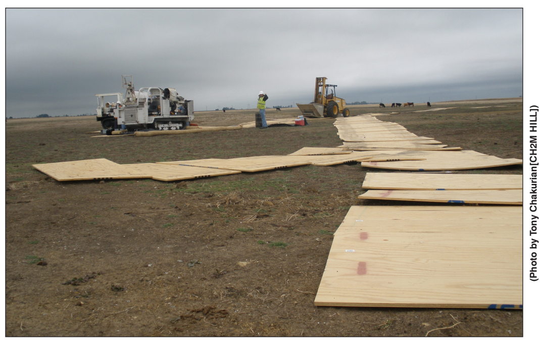
Walking the Plank: Field technicians created a roadway of wood panels across a sensitive environmental habitat to allow vehicles to reach groundwater sampling locations. Precautions such as these allow groundwater samples to be collected without damaging the overlying soil and vegetation.

AFCEE: The Air Force Center for Engineering and the Environment provides Air Force leaders with the expertise and professional services needed to protect, preserve, restore, develop and sustain the nation's environmental and installation resources.