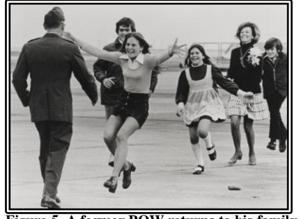
Figure 5. A former POW returns to his family on the Travis AFB flightline in February 1973 as part of Operation HOMECOMING.

Military Air Command's prime representative in this operation, the 60th flew 36 C-5 and C-141 missions and delivered over 22,000 tons of supplies and equipment.