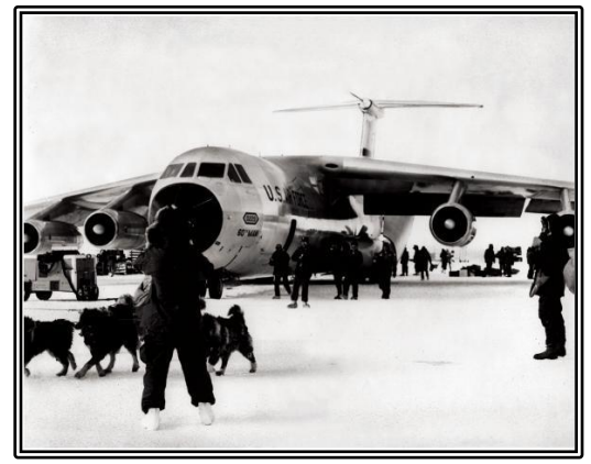
Figure 6. On 14 November 1966, the 60 MAW landed the first C-141 "Starlifter" at McMurdo Station, Antarctica as part of Operation DEEP FREEZE.

In October 1974, the 60th began supporting Operation DEEP FREEZE missions, the annual