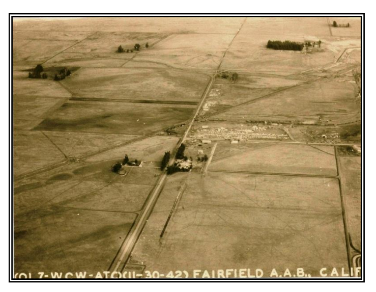
Figure 8. The Starting of Fairfield-Suisun Army Air Base in 1942.

On April 22, 1942, the Office of the Chief of Engineers, Washington DC, authorized spending $998,000 for construction of two runways and a few temporary buildings on 945 acres. The project received a top wartime priority, and construction began in the summer of 1942. On May 17, 1943, the Air Transport