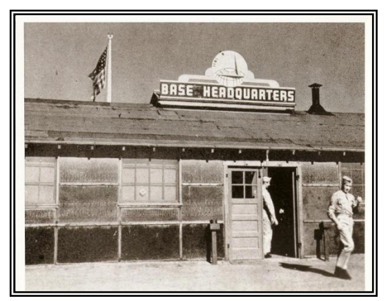
Figure 10: The First Base Headquarters on Fairfield-Suisun AAB c. 1943.

prairie during World War II. The field was named Fairfield-Suisun Army Air Base, after the two closest, mostly agricultural towns. The base was first planned shortly after the December 7, 1941 attack on Pearl Harbor as a home for medium bombers and fighters assigned to defend the West Coast. The first runway and temporary buildings were constructed by the Army Corps of Engineers in the summer of 1942. They were used initially by Army and Navy fighter planes for takeoff and landing practice. For a few months, the outline of an aircraft carrier's deck was painted on the runway to help newly-commissioned Navy pilots practice landings. The strong local prevailing winds nearly duplicated those at sea.