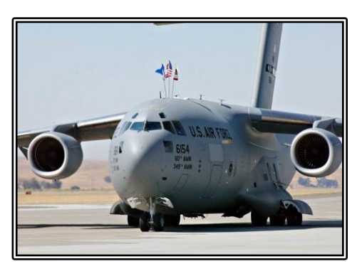
Figure 7: The first C-17 assigned to the 60AMW, "The Spirit of Solano," arrived Aug 8, 2006.

As missions in Air Mobility Command continued to evolve, the 60th led the way to