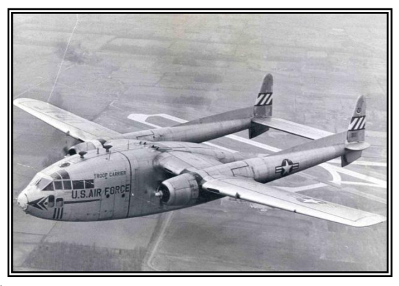
Figure 3. A C-119 Flying Boxcar from the 60th Troop Carrier Wing flies a mission over Europe, circa 1955.

On June 2, 1951, the wing replaced the 61st Troop Carrier Wing at Rhein-Main Air Base, where the 60th had been stationed on detached service. At this time, the 60 TCW resumed a tactical role and