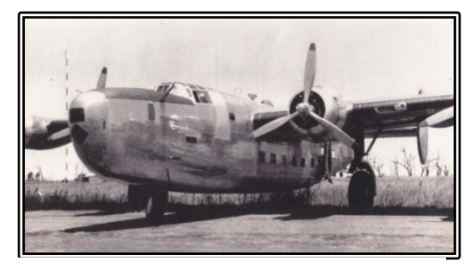
Figure 11: Consairways LB-30/B-24 pioneered air routes from California to the South Pacific.

"Liberator" bombers . The first host unit for the base was the 23rd Ferrying Group. At the end of WWII, the primary mission became the airlift of troops and supplies to occupied Japan and Korea, and the processing of war-weary returning GIs. On June 1, 1948, the Military Air Transport Service (MATS) assumed jurisdiction. In July, two of the base's air