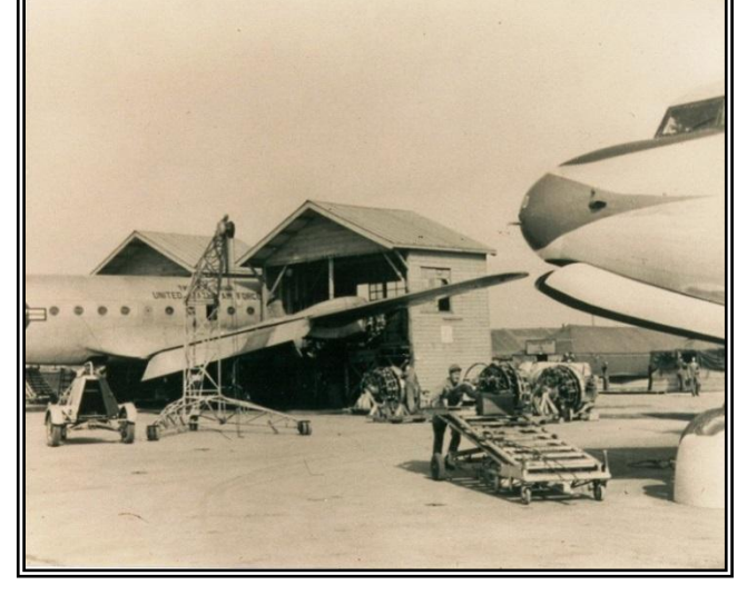
Figure 13. A C-54 "Skymaster" being worked on in the Nose Dock at Fairfield-Suisun AFB.

(later to be re-designated to the present 60th Air Mobility Wing). The 349th Military Airlift Wing (United State Air Force Reserve) moved to Travis from Hamilton Air Force Base, California, in 1969. Travis became part of the Air Mobility Command on June 1, 1992, when airlift assets from Military Airlift Command and Strategic Air Command tankers were fused into