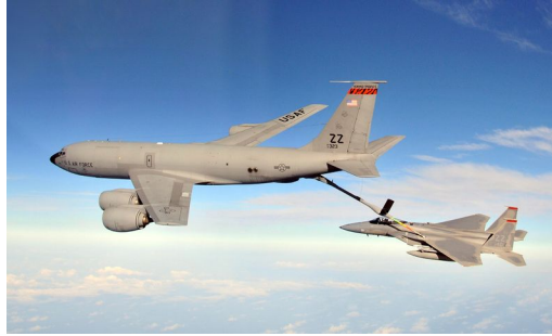
Photo of a KC-135R refueling F-15 Archived photo dated 1985

The KC-135 was the backbone of the tanker fleet arriving in service at Travis in 1959. It was the first jet-powered refueling tanker initially tasked with refueling strategic bombers, but used extensively in Vietnam War and later conflicts to extend the range of endurance for US tactical fighters and bombers. The Boeing co. designed the aircraft to not only refuel but carry up to 83,000 pounds of cargo. The last KC-135 aircraft departed Travis Air Force Base on 6 October 1983.