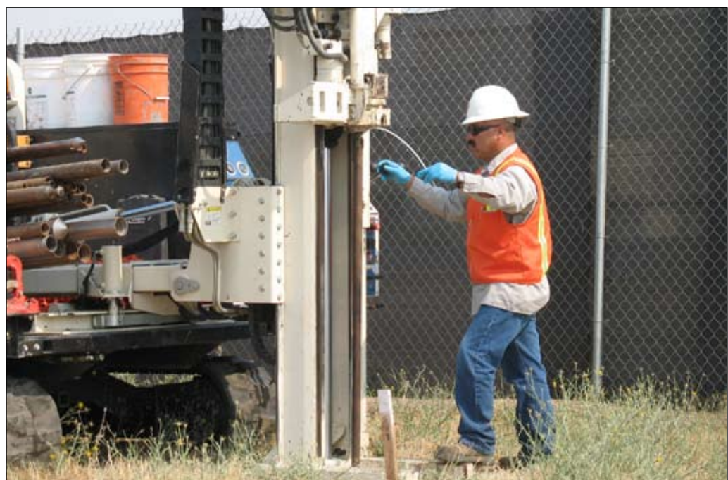
Pushing Probes: A field technician from Geoprobe, Inc. prepares to push a gas probe into the soil above groundwater that is contaminated with solvents. The plastic tube that protrudes from the top of the probe will be used to collect soil gas samples as part of a vapor intrusion assessment.

UVOx: Ultraviolet oxidation, is a two-step treatment technology that injects hydrogen peroxide into contaminated groundwater and exposed it to ultraviolet rays. Each peroxide molecule divides into two hydroxide ions that break contaminants down into harmless byproducts.